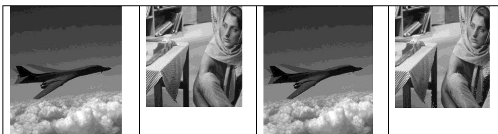
Figure 4. (a) Airplane image ( 512 \times 512 ), (b) Original Barbara Secret image ( 433 \times 433 ) (c) Stego airplane image after embedding Barbara image, and (d) Recover Barbara image.