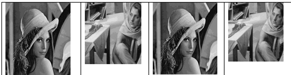
Figure 2. (a) Original Lena cover image ( 512 \times 512 ), (b) Original Barbara Secret image ( 389 \times 389 ) (c) Stego Lena image that has image (b) inside it, and (d) Recover image from (c)

The proposed approach is implemented in MATLAB 7.0. The cover image is decomposed into two levels using Haar wavelet. Embedding Factor ( EF ) is used to balance the embedding effect. It is better to use the lesser value of EF , so e^{-n} ( e is base of natural logarithms) is used where n is a positive integer such as n \geq 2 . Some of the images considered are shown in Figures 2-4.