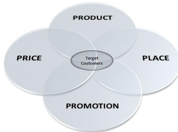
Fig. Four Ps classification.